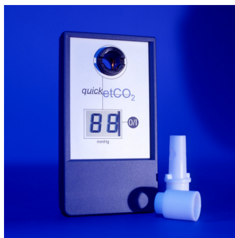
quick etCO 2 End-Tidal CO 2 (ETCO 2 ) Pocket Monitor